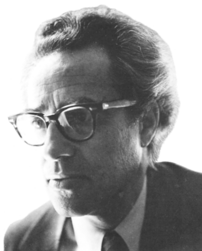
Figure 1: The late Eric H. Lenneberg as portrayed in Lenneberg & Lenneberg (1975).

This brief sketch of Lenneberg's life and education already reveals why he was probably uniquely suited to co-found what would later become biolinguistics together with two other young students who were at Harvard at the same time, the graduate student Morris Halle and the then even younger Harvard junior fellow Noam Chomsky. Their shared scepticism about the radical behaviourism that dominated psychology in Cambridge at the time led them to read a lot of the now classical ethological literature coming from Europe (e.g., Konrad Lorenz, Nikolaas Tinbergen, Otto Koehler, etc.). Lenneberg and Halle could speak German and would frequently read ethological publications in their original language. This reading matter provided a basis for considering the human language capacity as being rooted in the biological nature of the species, rather than a cultural or technological achievement (for a brief recap of these early days see the interview with Noam Chomsky in this issue). Together, Lenneberg, Halle, and Chomsky spearhead the cognitive revolution in linguistics and psychology by adopting a biological approach to the study of the human language capacity. While Chomsky's own work focused on the formal analysis of natural language (also reflected in the ap-