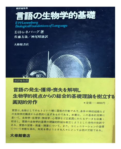
Figure 2: The cover of the Japanese translation of Biological Foundations of Language.

Biological Foundations of Language was first published in 1967 and, somewhat surprisingly, has never been reissued, neither in its original nor as an updated version. However, a German translation was published as Biologische Grundlagen der Sprache only in 1972 and, as Koji Fujita brought to my attention, a Japanese translation of the book also exists (see figure 2). Interestingly, Lenneberg used the foreword for the Japanese translation of the book to clarify what he meant by discontinuity in the evolution of language, emphasising the qualitative difference between human language and animal communication systems and pointing out that such a discontinuous take on language evolution does not imply that natural history itself is discontinous—a topic that is also taken up in two contributions to this special issue by Callum Hackett as well as Sergio Balari and Guillermo Lorenzo.